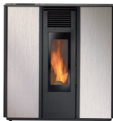
Bianco Gres pezzo intero