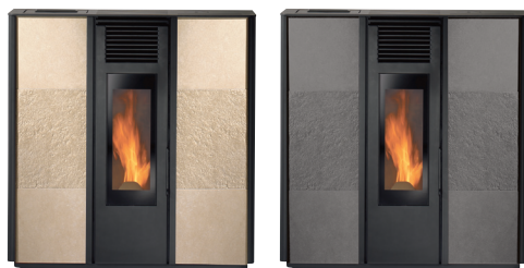
Beige Grigio Gres suddiviso in 3 pezzi

(a) = uscita aria calda (f) = uscita fumi